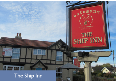
The Ship Inn