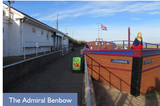
The Admiral Benbow

Advertised as a 'small friendly bar with a nautical feel'. The building was originally a public toilet and workers' hut before being converted in 1997 to a pub. Inside it is fitted out with wood reclaimed from old groynes from Chapel beach. While the building may not be very old, the pub takes its name from Vice Admiral John Benbow, a 17th century Vice Admiral of the Royal Navy, considered the Nelson of his times. Benbow achieved fame in the battles of Beachy Head, Barfleur and La Hogue.